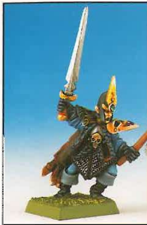
The Black Ark Corsair is one of the new troop-types from Warhammer Armies – Dark Elves. With blank Event cards you can add many deadly monsters to your games.