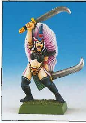
A Dark Elf Warrior, a Witch Elf and a Black Guard of Naggaroth are just a few of the exciting new models in the Citadel Miniatures Dark-Elf range. Using blank Event cards, you can pit your Warriors against these evil foes in your games of Warhammer Quest.