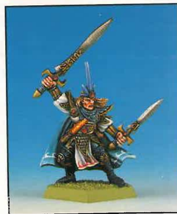
Jes Goodwin's brilliant Warhammer Quest Elf Ranger

Elf Ranger Warrior Pack £6.99 (Boxed set with one model, cards, counters and rulebook)