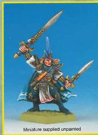
Miniature supplied unpainted