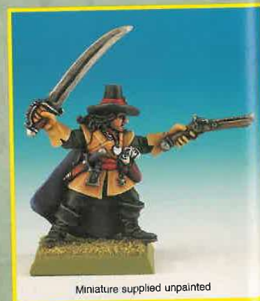
Miniature supplied unpainted