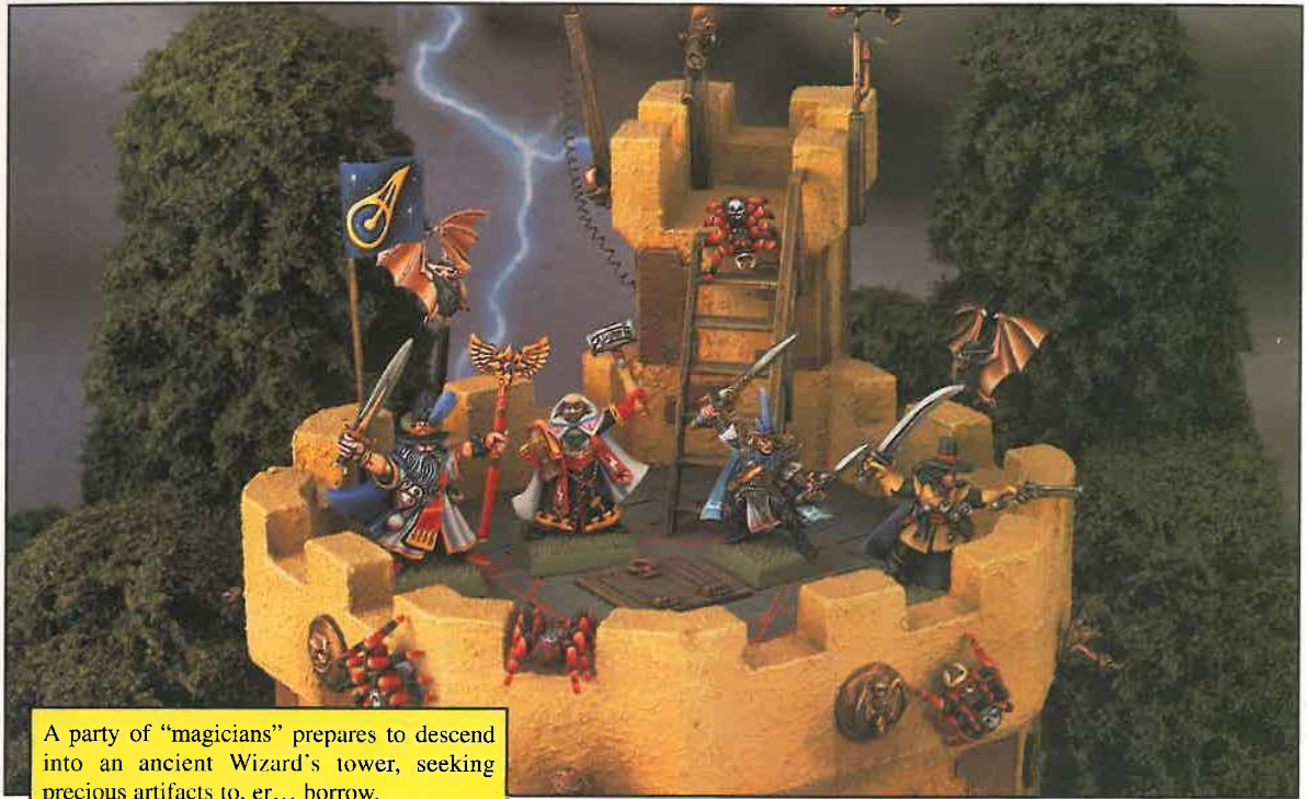
A party of "magicians" prepares to descend into an ancient Wizard's tower, seeking precious artifacts to, er... borrow.

enemies and perhaps retrieve some powerful lost artifacts – maybe even the Crown of the Phoenix King! Because the Ranger can be either a Mage or a Knight, it is quite possible to take two Rangers in the same party of Warriors. One can be a