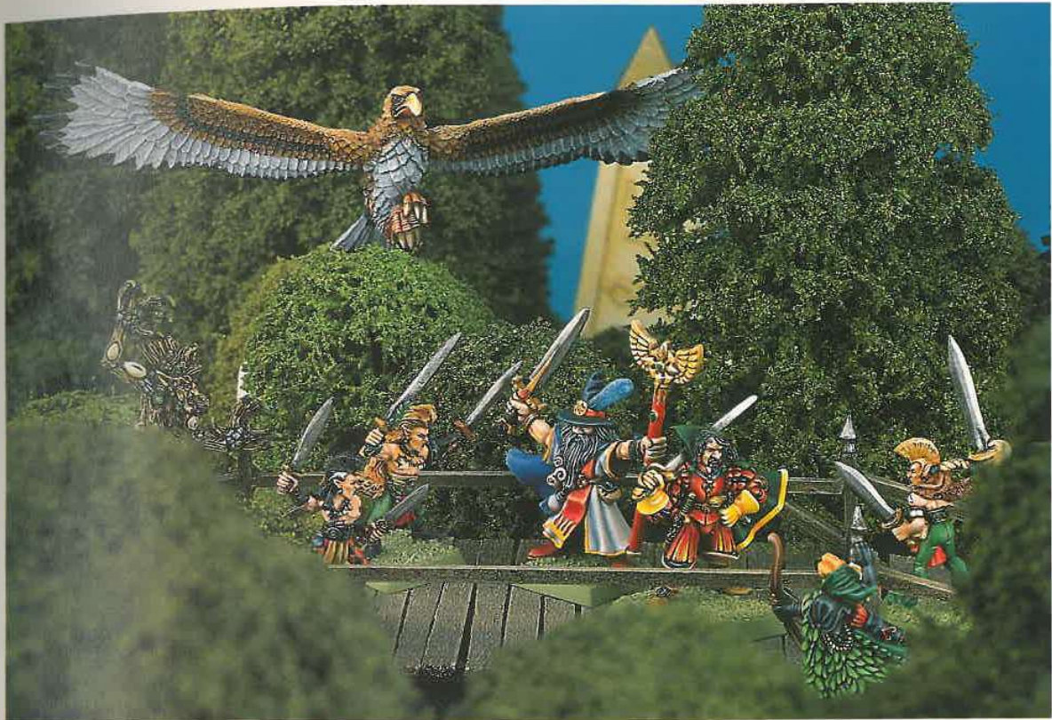
On a precipitous walkway high in the forest canopy above Athel Loren, fiercely territorial Elves seek to drive off explorers.