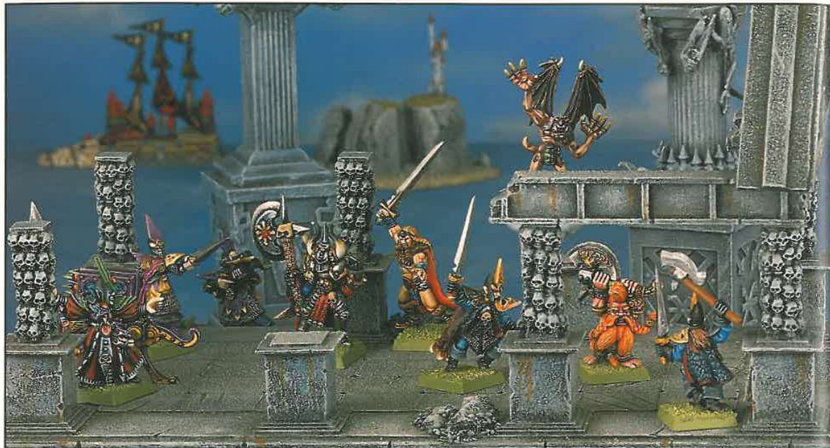
A vicious melee breaks out on board a Dark Elf Black Ark as a party of adventurous captives attempt to mutiny.

Those of you who own Warhammer armies are at a distinct advantage when it comes to turning out well-rounded, linked scenarios. Having a Warhammer army means that you should have a wealth of models at your disposal and be able to run games based around the particular race you field. From a background viewpoint, this is a considerably more desirable way to play games than the random dungeons, which contain the full gamut of nasties all crammed into the same small space, and also makes for good plot development. Consider, if you dare, the machinations of a Dark Elf prince bent on world domination. If that happens to be your army, then you have the